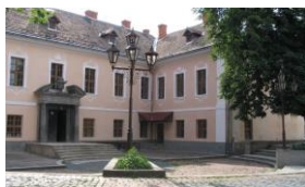
White Palace – former residence of Shenborn Count