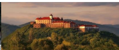
Architectural monument of national importance - Mukachevo Historical Museum "Castle Palanok"